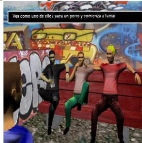
Figure 1. Drug addiction detection scene

The student's relationship with his parents is also studied in three scenes: one scene checks the father's behavior, another, the mother's attitude and a third both. In the first two scenes, the student gets home much later than the hour agreed upon and checks whether the father or the mother scold him, threaten him or, on the contrary, are indifferent to his undisciplined behavior. In the third scene, the student gets home after school and feels anxious because he has problems with his studies and it checks whether his parents become involved in his problems or are indifferent to them. There are other scenes where personality-related problems and the student's mood, attention in class, beliefs and integration in social groups are checked.