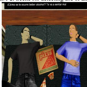
Figure 2. Scene for detecting use of alcohol

Face animations were developed focusing on the character's face in more detail to increase expression and realism of the body animations. So if one character is threatening another in a given scene, his face expresses aggressiveness, or if on the contrary, a character feels threatened, his face shows fear. To accomplish this level of expression in the characters' faces, the number of polygons and level of detail increases noticeably in eyes and lips, the zones most affected (Figure 2).